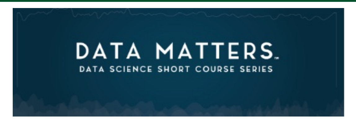
August 7-11th, Virtual

Data Matters<sup>™</sup> is a week-long series of one and two-day courses aimed at students and professionals in business, research, and government. The short course series gives students the chance to learn about a wide range of topics in data science, analytics, visualization, curation, and more from expert instructors.