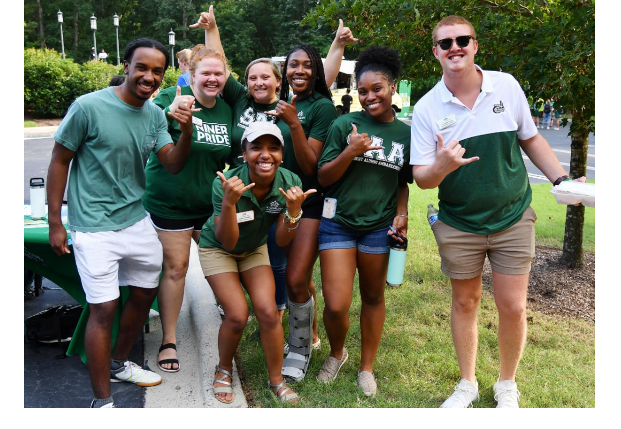
Tuesday August 24, 2021; 5:00pm - 7:00pm

New School of Data Science graduate students are invited to an outdoor reception. The event will be held outdoors on the lawn between the Belk Gym and Cone building. Sponsored by the Center for Graduate Life (CGL) No registration required.