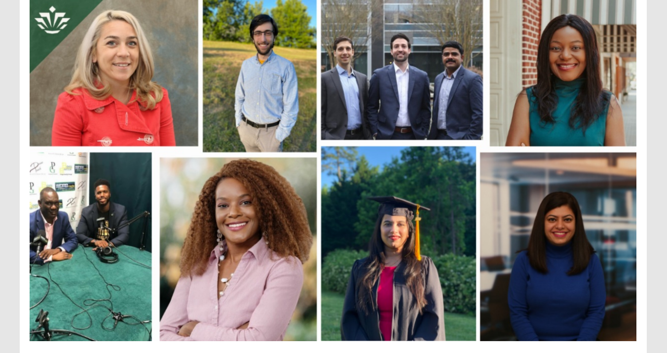
Congratulations to all of our Spring 2021 graduates!

After graduation and beyond, we'd love for you all to stay engaged with your specific program and the School of Data Science. You are invited to update your contact information below, and identify ways that you would prefer to engage with the School going forward: mentoring, sponsoring an internship, participating in networking sessions, etc.